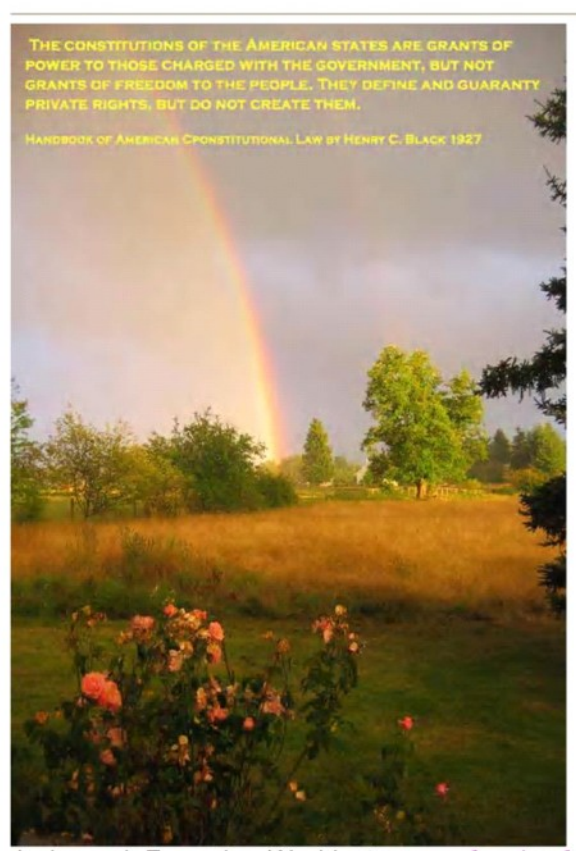
Jacksranch Enumclaw Washington www.freedomforallseasons.org

Concord Massachusetts The Famous North Bridge Where rural farmers turned back the British and Hessian Soldiers Who marched on their guns, cannons, ammo dumps and property Who burned their homes, stole their personal private property All while they were forcibly quartered in Boston property owner homes and in British barracks www.concordchamberofcommerce.org www.nps.gov.mima